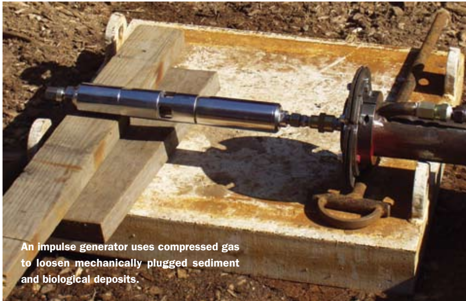
An impulse generator uses compressed gas to loosen mechanically plugged sediment and biological deposits.

zone, and, through a pressurized hose, temporal impulses of high-pressure nitrogen are released. The impulse generator is equipped with a valve system that releases the accumulated energy (200 psi to 1,200 psi) in millisecond bursts through a large cross-sectional area.