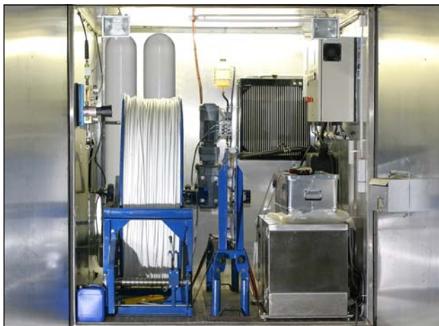
hydropuls® - 10ft Container