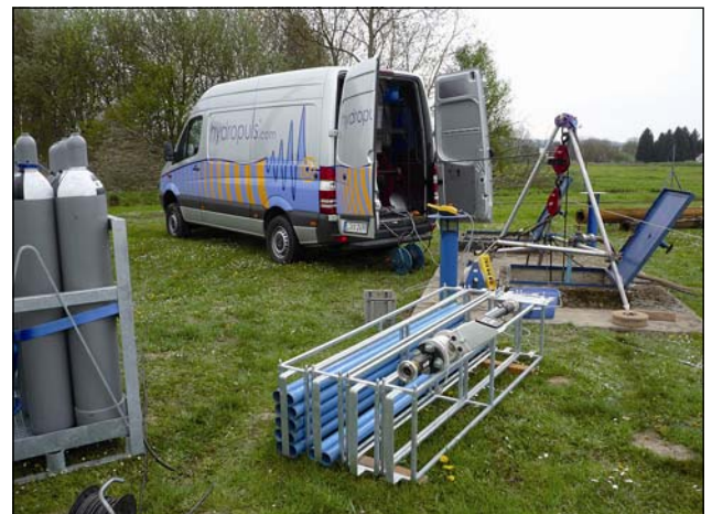
Well and borehole intensification with hydropuls®

The company pursues a strongly international orientation. It is the objective to establish the brand hydropuls® worldwide in the next 5 years.