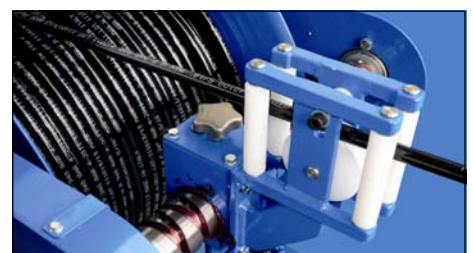
Electric hose reel for up to 500 m high pressure hose.