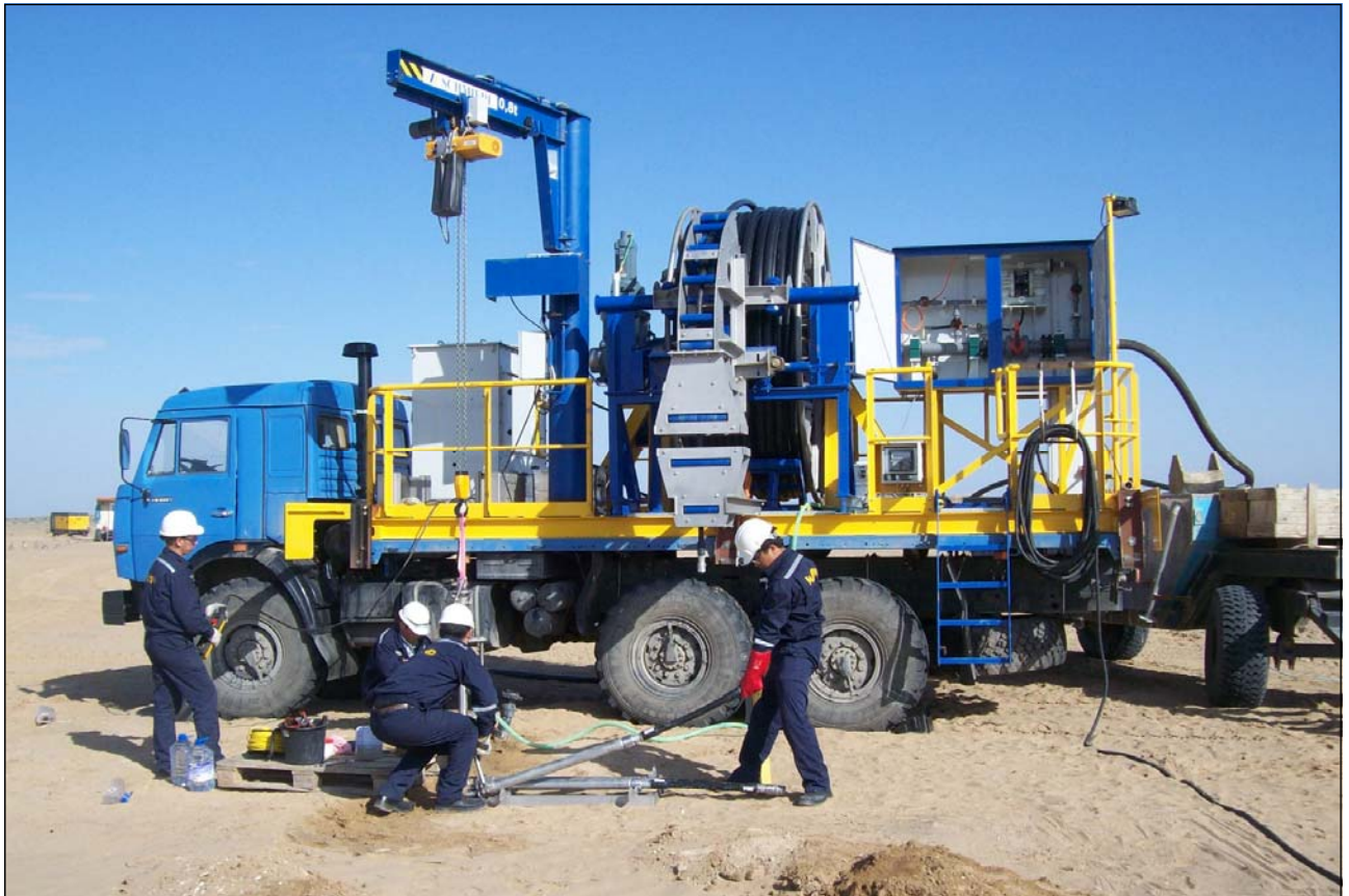
Photo: hydrolift operation in Kazakhstan parallel or after pulsing with hydropuls ® - process. Special development of TLM hydropuls GmbH for JV Katco (Areva-Kazatomprom)