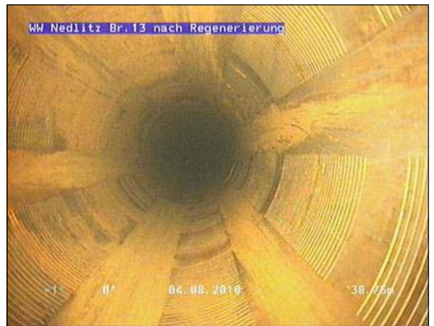
Photos: Well winding wire and PVC filter before and after completed regeneration using the hydropuls® process